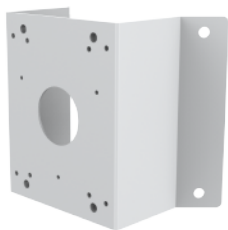
A35 CORNER MOUNT