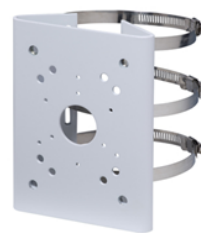
A36 POLE MOUNT