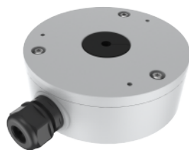
TC-P54BM SPEC: V5 JUNCTION BOX